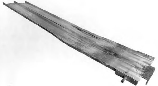
Figure 9 - Twin RA330 shaker hearths used in a clean hardening operation.

Figure 9 again shows one of two twin shaker hearths used for both clean hardening and carbonitriding. Cast HX hearths gave erratic life amounting to as little as 3 months service. This user has tried RA333 in three furnaces over a five year period. Life ranged from 18 to 22 months.