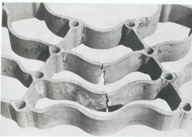
Figure 5 - Cast HT grid displaying thermal fatigue damage after usage in a gantry furnace. RA330 wrought plate was welded to expand the grid (bottom piece). Note the RA330 did not suffer cracking.

The wrought portion of the fixture, seeing the same exposures is relatively unaffected. In fact, saw cutting marks are still visible on the plate.