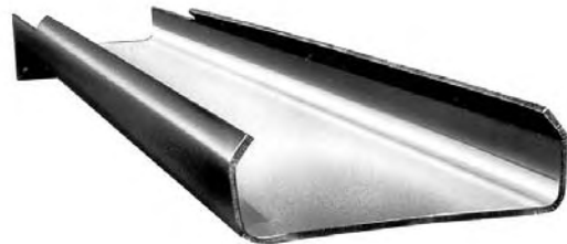
Figure 10 - RA333 shaker hearth taken from a twin shaker furnace. Hearth was fabricated from 3/8" plate.

The original thickness of the hearth shown in Figure 10 was 3/8". This has subsequently been reduced to 5/16", which has further improved the economy of the RA333 construction. Incidentally, the radiant tubes for these furnaces are also RA333 material.