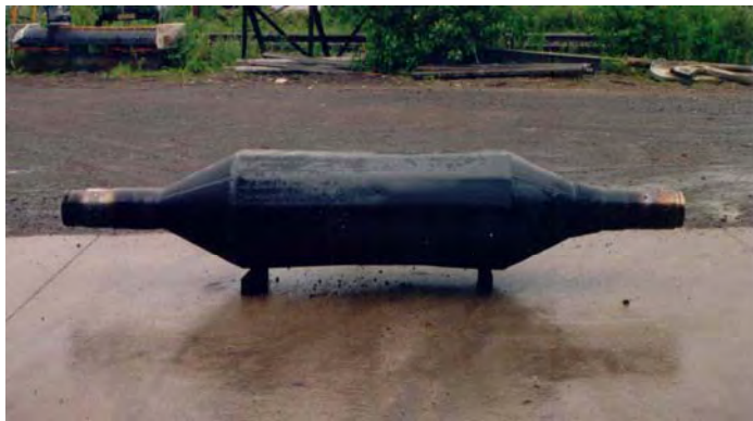
Figure 2 - 5/8 in. thick RA330 rotary retort. Operated 15096 hours in furnace for carburizing roller bearings. 1 in. wall cast retort averaged 8000 hours

A 5/8" thick fabricated retort made of RA330 was installed. The lighter construction brought the cost of the RA330 fabrication to within 10% over the cost of the cast retort. After 15,000 hours in service the wrought retort was still usable, but was removed from service for evaluation.