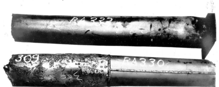
Figure 6 - Firing leg fabricated using three test lengths of three different alloys; RA333, RA330 and 309.

Figure 6 shows the firing leg of a trial fabricated radiant tube removed from a 5 row pusher malleablizing furnace (cut in two for the illustration). It is a horizontal, straight through design approximately 20 feet in length. It was made up of one section of RA333 nearest the burner, followed by an RA330 section, and finally a 309 section.