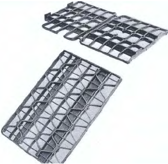
Figure 4 - View of serpentine RA330 tray and the cast HT tray that it replaced for use in carburizing service followed by an oil quench.

Figure 5 is a classic example of thermal fatigue cracking and surface attack. The cast grid was used in a gantry furnace at temperatures up to 1850°F, neutral atmosphere, with quenches in salt, oil, or brine.