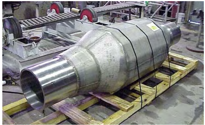
Figure 3 - View of a completed RA330 rotary retort ready for shipment.

In addition, to improving the service life an added bonus of the wrought fabrication was the flexibility it allowed in the design. Clearances in the furnace were such that a larger retort could be utilized. Increasing the size of the cast retort was not attempted due to the high costs associated with producing a new pattern. The volume of the retort was increased enough to process of 20% more bearings. Thus, the economy of the wrought fabrication was further improved.