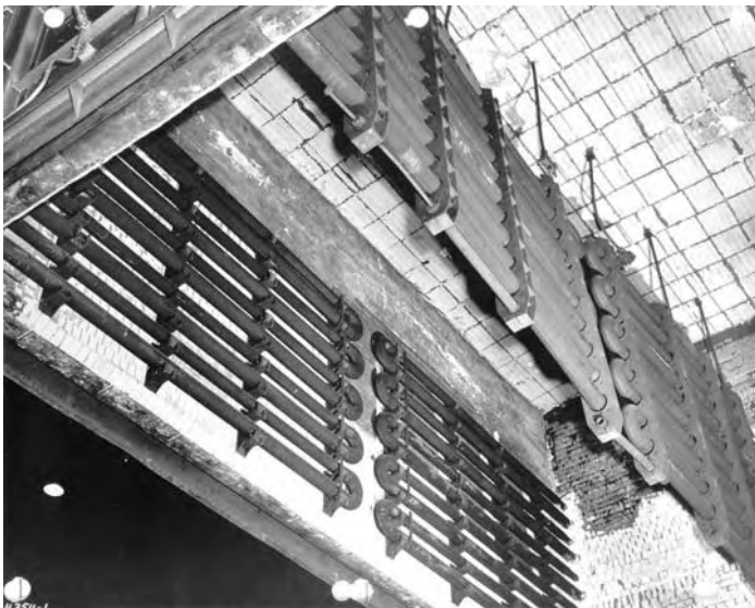
Figure 8 - Horizontal U-tubes fabricated from RA330 material. These tubes replaced cast HH tubing.

Figure 7 illustrates a trial RA333 tube 3/16" thick. This tube was in service for four years prior to its removal. It was removed only because the furnace was being replaced. Cast HT tubes averaged two years life. RA333 was selected for the new furnace unit based on the trial.